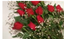
Northern Colorado ARMA Chapter celebrates 20 years!

We hope to see you at one or more of the programs!