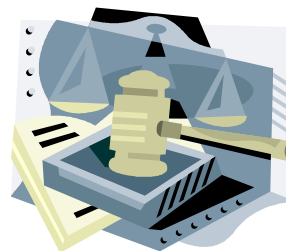
Cracking down on SPAM!

that automate spam and the forging of e-mail headers, which contain identification information about senders and their service provider. Spammers often forge the headers to hide their identity. AOL, Yahoo, and Microsoft recently announced a joint initiative to combat spam by identifying and restricting messages with deceptive headers.